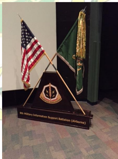
8 th MIS Bn (ABN) Colors on display at Birthday celebration